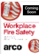
Workplace Fire Safety Fire risk consultancy Fire safety training Fire extinguisher advice & maintenance