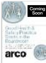
Good Health & Safety Practice Starts in the Boardroom Occupational health, safety and wellbeing programmes developed for the directors and management of larger enterprises